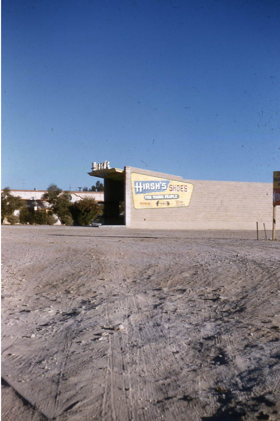
Historic Photo 004

Planning & Development Services Department (PDSD) - 201 N. Stone Avenue P.O. Box 27210 - Tucson, AZ 85726-7210 Telephone: (520) 791-5550 - Fax: (520) 791-5852 Website: www.tucsonaz.gov/pdsd Email: DSD_zoning_administration@tucsonaz.gov