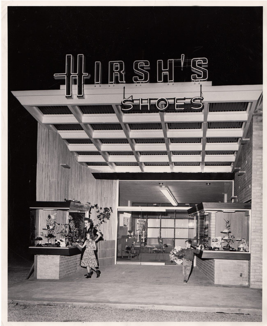
Historic Photo 001

Planning & Development Services Department (PDSD) - 201 N. Stone Avenue P.O. Box 27210 - Tucson, AZ 85726-7210 Telephone: (520) 791-5550 - Fax: (520) 791-5852 Website: www.tucsonaz.gov/pdsd Email: DSD_zoning_administration@tucsonaz.gov