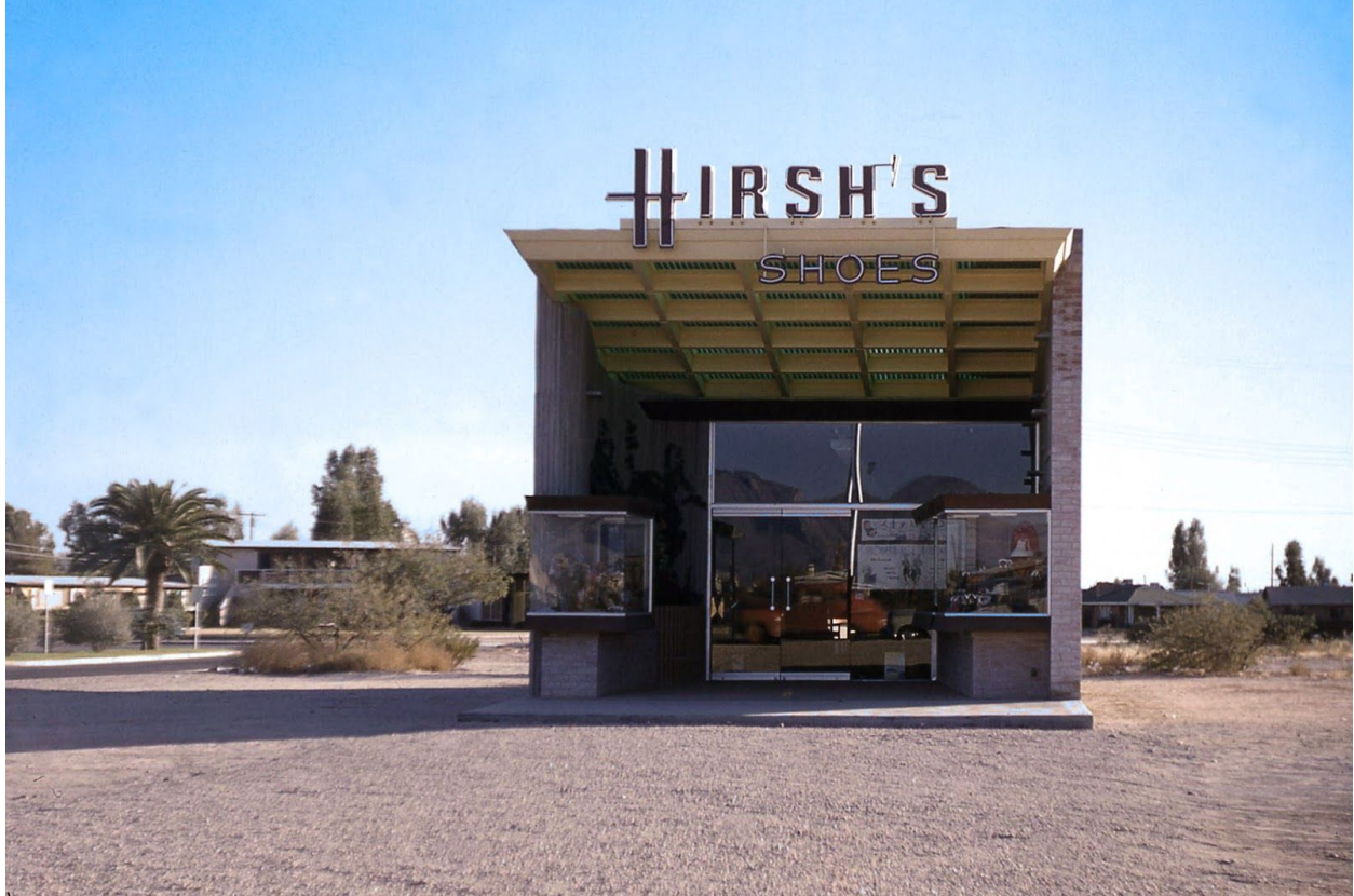
Historic Photo 003