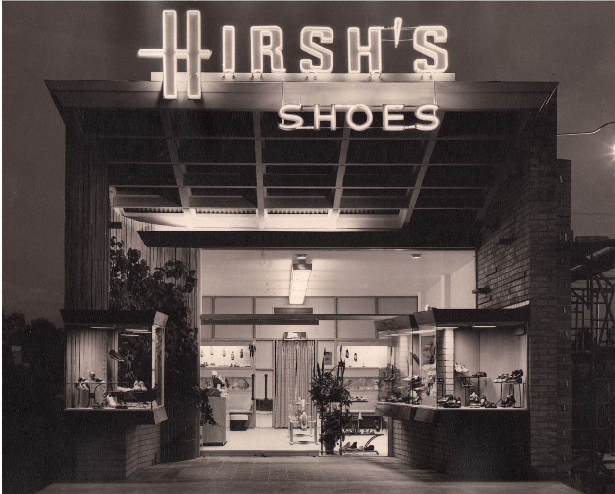
Historic Photo 002

Planning & Development Services Department (PDSD) - 201 N. Stone Avenue P.O. Box 27210 - Tucson, AZ 85726-7210 Telephone: (520) 791-5550 - Fax: (520) 791-5852 Website: www.tucsonaz.gov/pdsd Email: DSD_zoning_administration@tucsonaz.gov